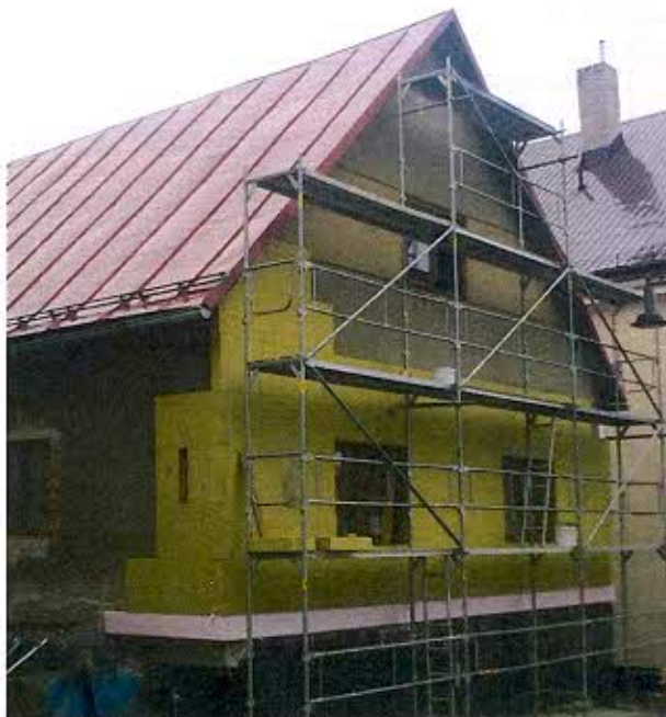
Example of use Isover TF PROFI

Isover TF PROFI facade slabs with longitudinal fibre are suitable for external thermal insulation composite systems (ETICS), where they are glued and mechanically bonded to a sufficiently coherent and sound wall surface. The layers of contact insulating systems are applied on the slabs: bond, reinforcement grid, penetration, plaster, and paint. Bonding of the slabs can be performed with the glue being applied along the edge and at the patches in centre of the slab. The number of the anchors for mechanically anchoring is usually 5 to 6 pc/m 2 , the exact number to be specified by the designer. The anchors will be arranged according to the instructions of the certified insulating system manufacturer. Appropriate also for flush mounting systems.